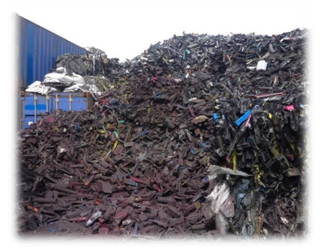
Around 75% of Printer Cartridges End Up in Landfill each year